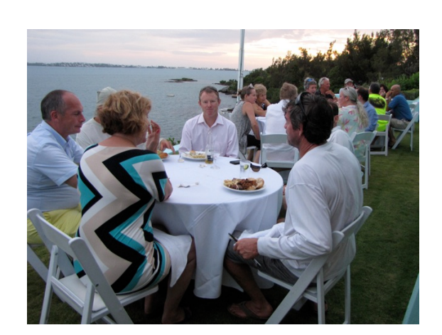
Everybody headed home around 9.15pm as it was another early morning start.